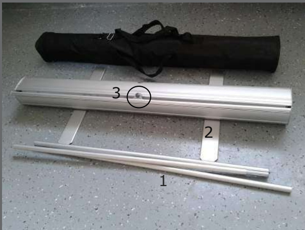
Support bar (1), Roll-up stand (2), Banner holder (3)

1. Take all components from the portable bag.